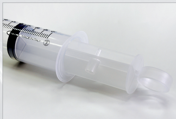
Adapter 100 ml